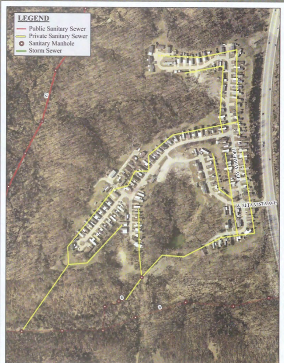
Extensive Private Collections System