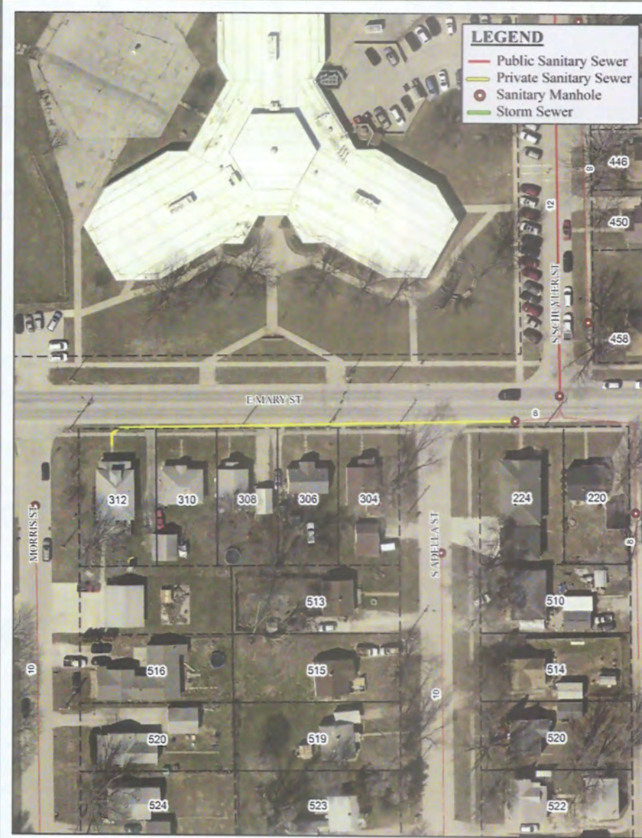
Small Private Collections System