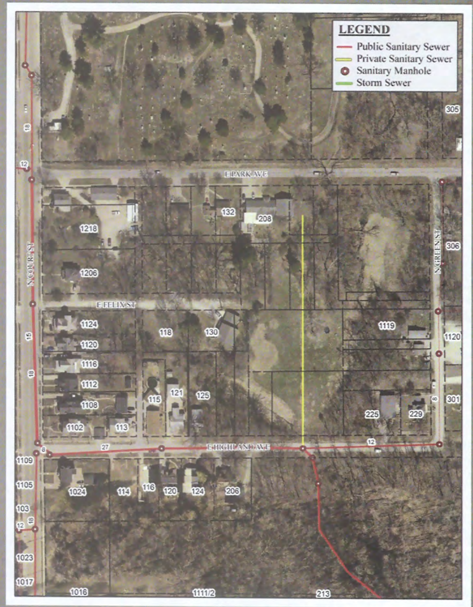
Private Sewer Lateral (545 L.F. long)