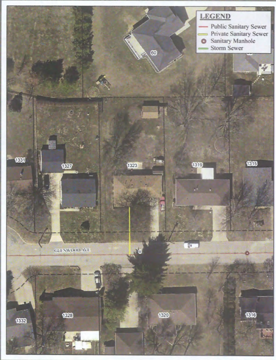
Private Sewer Lateral (55 L.F. long)