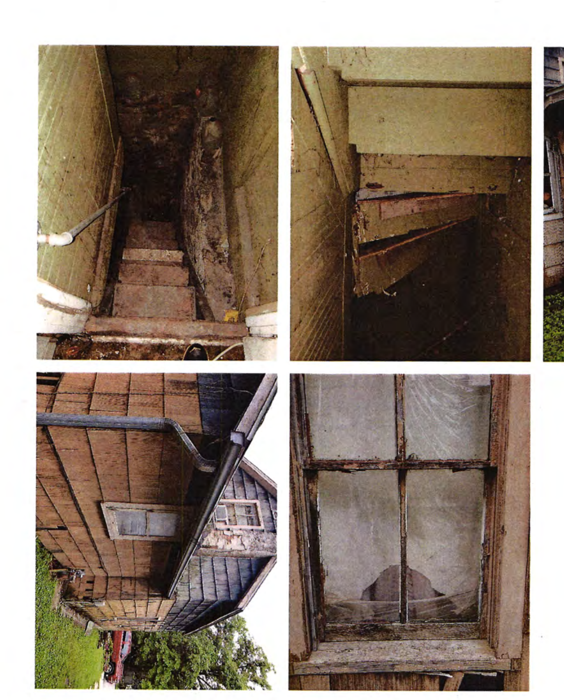
811 W Second 8/26/19